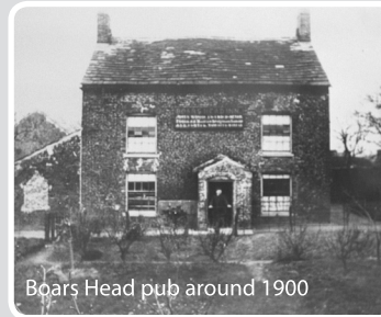
Boars Head pub around 1900