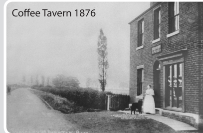
Coffee Tavern 1876